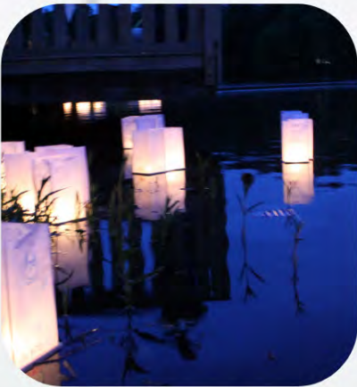
Lantern Launch Page 14