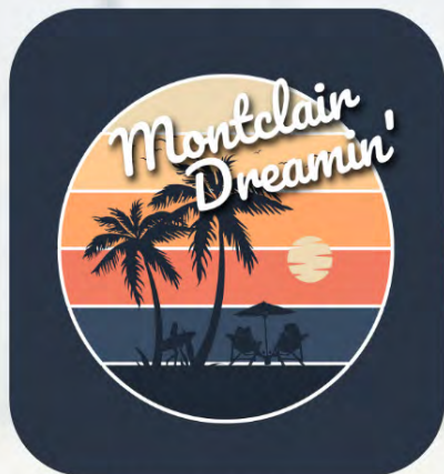
Montclair Day Page 18/19